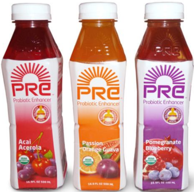
Orange and Blueberry

There are many ways to promote digestive health, and now PRE Beverage Company has introduced two more: PRE Probiotic Enhancer beverages and Probiotic Drink Mixes. The line of fusion organic juices enhanced with proprietary Jarrow Formulas prebiotic health blend keep your gut healthy by promoting the growth of beneficial in three refreshing flavors, has 50 calories per 16.9 fluid ounces and is sweetened with organic cane sugar. And there's a 10-calorie version, PRE 10, sweetened with a blend of stevia and organic cane sugar, in four flavors. PRE is also available in a drink mix you can take on the go and add to any water bottle. In four flavors, Pre Powder Synbiotic Drink Mixes have 20 calories in each 0.25-ounce packet and come in six packs. www.preusa.com